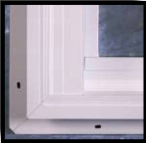
Integral Brick Mold with J-Channel & Nail Fin