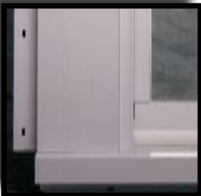
Optional Eastern Casing with J-Channel & Nail Fin