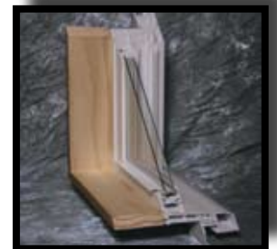
6 9/16" Stain Grade Jamb Extension

BFRich brings its reputation for quality, craftsmanship and customer satisfaction to the new construction industry. Introducing its WOODBRIDGE all-vinyl fusion-welded, tilt window system.