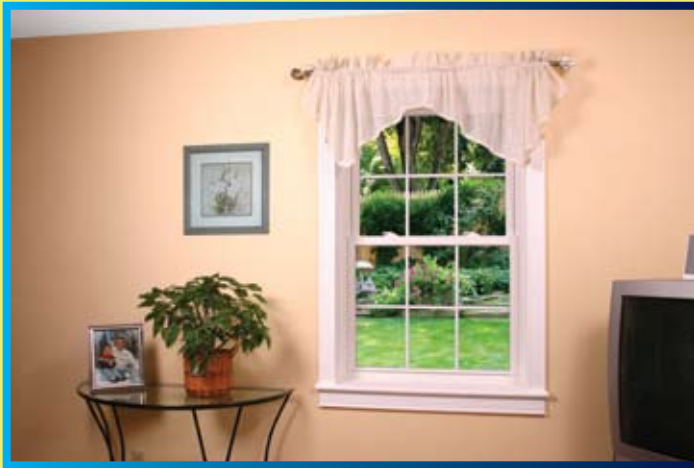
Elite Green Shield Windows are ENERGY STAR®-qualified in all 50 states.

Designed to ensure top performance, the Elite Green Shield window system has triple insulating glass, double Low-E glass, argon gas filling, Duralite™ warm edge spacer, and Enviro-Foam insulated frame and sashes, anti-microbial treated weather seals and UltraVue screen cloth.